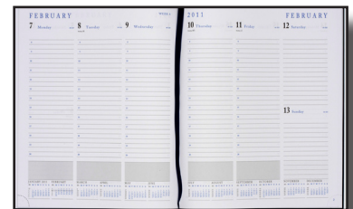
Format 2: Week-to-View