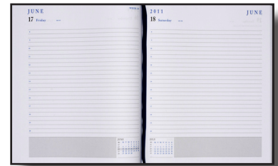
Format 1: Page-a-Day